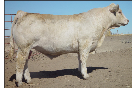
SCHURRTOP HUSKER 9894 P M965865

Biggest ribeye, marbling, highest growth proven bull in the Entire Breed .