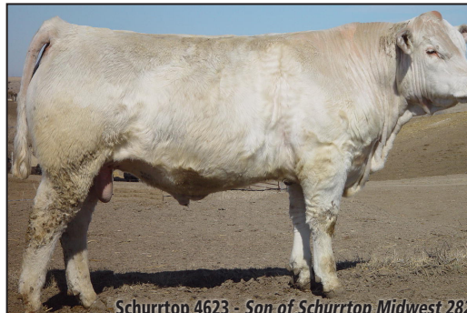
SCHURRTOP CHANNEL 430Y M900618

Tops for growth and muscle. Thick and bold made with consistent calving ease. He does it all.