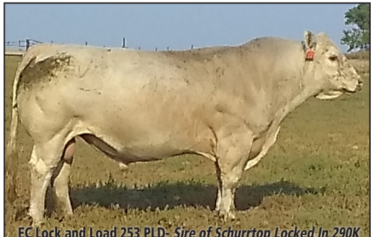
SCHURRTOP LOCKED IN 290K P M950529

Standout carcass with superior marbling. Thick and smooth with calving ease and all the extras.