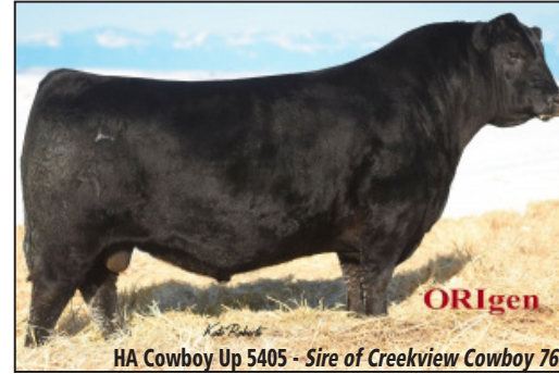
HA Cowboy Up 5405 - Sire of Creekview Cowboy 760

Powerhouse of a bull. Extra muscle, total performance and proven efficiency. Top percentile of the breed for multiple traits. Maternal and efficient with top carcass merit.