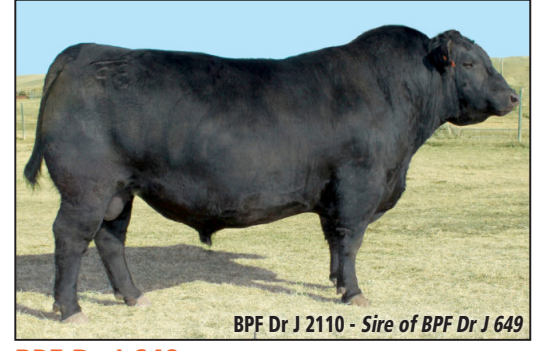
BPF Dr J 2110 - Sire of BPF Dr J 649

Dominating Efficiency. Powerful daughters that are fertile, motherly, and hold up. Extra muscle, shape, doability, total performance sire. Top 10% for Marbling and $Beef.