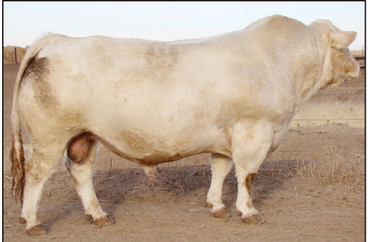
SCHURRTOP EATON CHOICE K717 M807695

BW WW YW Milk CW RE Fat Marb TSI EPDs -1.5 +60 +140 +6 +26 +1.34 +0.023 +0.05 280