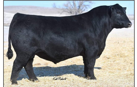
SITZ RESILIENT 10208 19057457

Massive depth, growth, fleshing ability and power. Very complete package. Efficiency proven. His daughters in production are truly impressive.