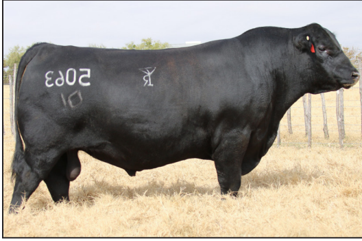
BAR R JET BLACK 5063 18389838

BW WW YW Milk IMF RE Fat $B EPDs +1.6 +80 +142 +22 +64 +81 +0.39 188