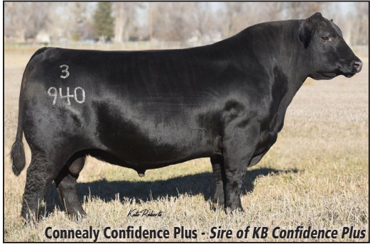
Connealy Confidence Plus - Sire of KB Confidence Plus

Dr J is a man amongst boys and is an impressive individual from a phenotype, performance, and efficiency stand point.