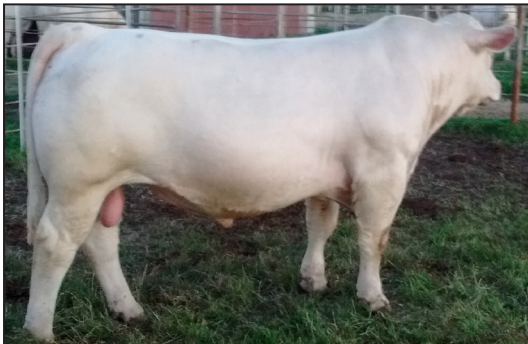
M6 NEW STANDARD 545 M877659

The undisputed carcass champion in the breed for a combination of ribeye and marbling. Huge performance in pounds, moderate in stature, and extremely docile. Sires powerful depth, thickness and consistency.