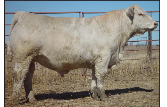
SCHURRTOP BEEF MAKER 9598 P M950351

2022 high selling bull to Wienk Charolais. Maternal brother to Beef Maker. Powerful, shapely, consistently high performing. Total performance, high carcass value and extra quality.