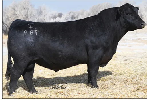
McD EFFECTIVE 789 18952013

All around total performance sire of true quality. Thickness, depth, outcross genetics with all the extras!