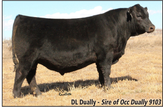
DL Dually - Sire of Occ Dually 9103

BW WW YW Milk IMF RE Fat $B EPDs +2.6 +78 +127 +12 +.60 +.80 +.034 171 Dr J is a man amongst boys and is an impressive individual from a phenotype, performance, and efficiency stand point.