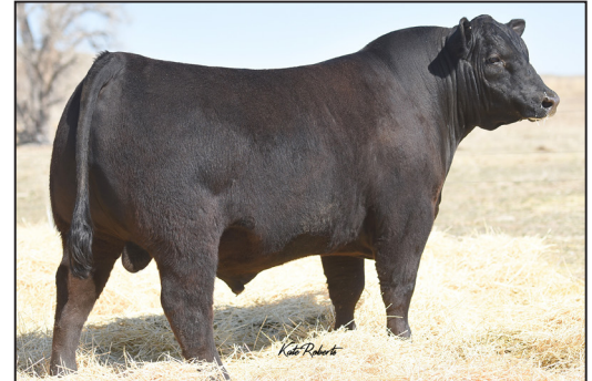
MUSGRAVE FEATURE 19202252

BW WW YW Milk IMF RE Fat $B EPDs +.4 +68 +116 +27 +.42 +.47 -.031 119 Massive depth, growth, fleshing ability and power. Very complete package. Efficiency proven.