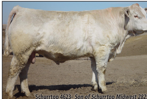
SCHURRTOP CHANNEL 430Y M900618

BW WW YW Milk CW RE Fat Marb TSI EPDs +1.1 +77 +126 +27 +39 +1.24 +.009 +.17 +266 Tops for growth and muscle. Thick and bold made with consistent calving ease. He does it all.