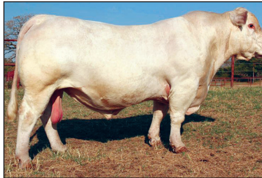
M6 NEW STANDARD 842 P ET EM756753

BW WW YW Milk CW RE Fat Marb TSI EPDs -1.3 +58 +136 +4 +26 +1.33 +.026 +.05 288 Biggest ribeye, marbling, highest growth proven bull in the Entire Breed .