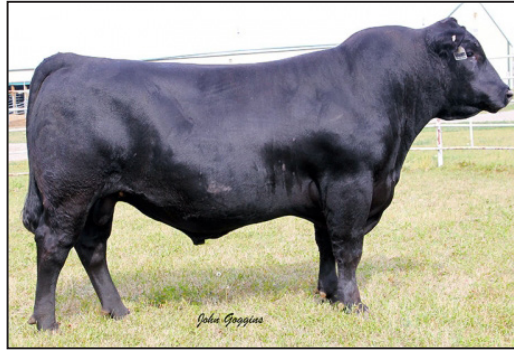
HILLTOP WIDE OPEN 4215 17901712

BW WW YW Milk IMF RE Fat $B EPDs +1.4 +79 +142 +24 +67 +.76 +.029 175 All around total performance sire of true quality. Thickness, depth, outcross genetics with all the extras!