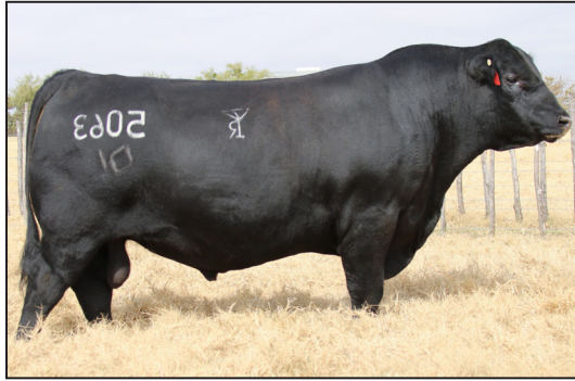
BAR R JET BLACK 5063 18389838

BW WW YW Milk IMF RE Fat $B EPDs +1.4 +79 +142 +24 +67 +.76 +.029 175 All around total performance sire of true quality. Thickness, depth, outcross genetics with all the extras!