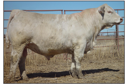
SCHURRTOP BEEF MAKER 9598 P M950351

BW WW YW Milk CW RE Fat Marb TSI EPDs -1.6 +68 +130 +26 +38 +.95 +.021 +.33 279 Many time multi trait leader. Calving ease, growth, muscle, and marbling.