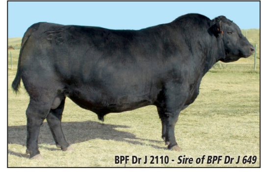
BPF Dr J 649 18567486

BW WW YW Milk IMF RE Fat $B EPDs +1.0 +69 +144 +17 +.54 +.68 +.003 158 Top 2% growth numbers. Extremely long, correct, powerful offspring from a very maternal total performance pedigree.