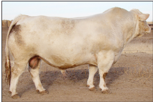
SCHURRTOP EATON CHOICE K717 M807695

BW WW YW Milk CW RE Fat Marb TSI EPDs -1.3 +58 +136 +4 +26 +1.33 +.026 +.05 288 Biggest ribeye, marbling, highest growth proven bull in the Entire Breed .