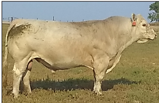
EC LOCK AND LOAD 253 PLD M865372

BW WW YW Milk CW RE Fat Marb TSI EPDs -3.4 +67 +114 +21 +18 +.64 +.005 +.33 262 Standout carcass with superior marbling. Thick and smooth with calving ease and all the extras.